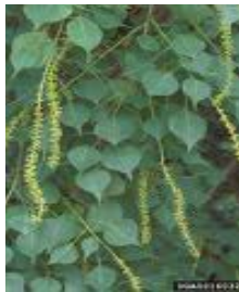
'Chinese Tallow' pictured above

For a complete list of exotic invasive plants and trees, visit the Florida Exotic Pest Plant Council at: http://www.fleppc.org/